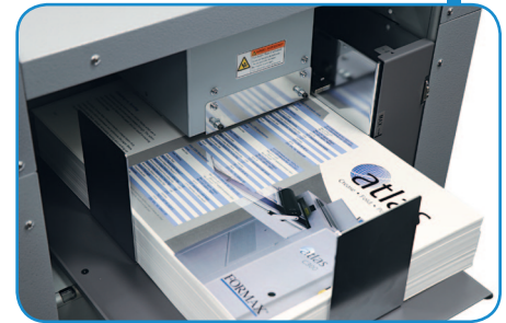
Upper-belt tri-suction feed system for accurate feeding of large & heavy stocks