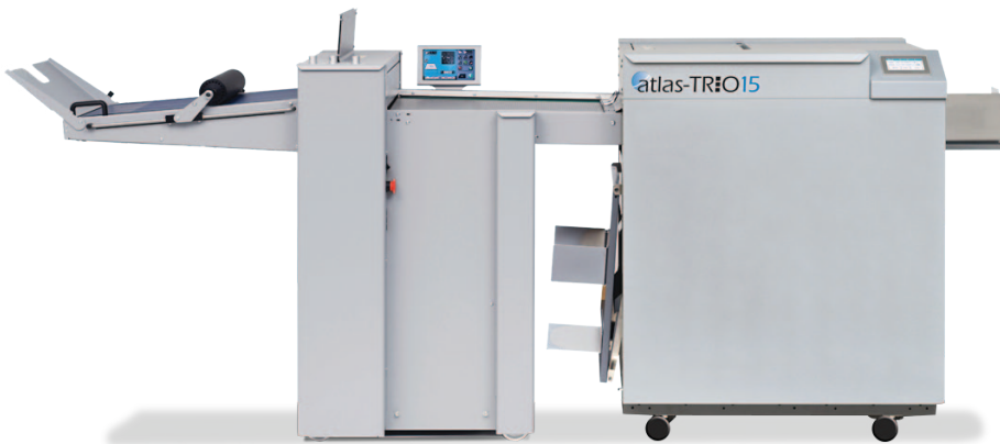
Pair the Atlas-TRIO15 with the optional AC-10 Folding Unit to slit, cut, crease and fold in one streamlined pass

11" x 17" Sheet: 4-up postcard, single crease ledger