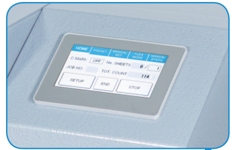
Color touchscreen control panel

* Speed varies depending on paper weight